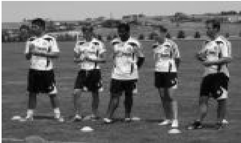
July brought the British Challenger Soccer Camp to Cheyenne.

CSC greatly appreciates our volunteers for their time to benefit our kids and the organization. Let them know they are valued. Without our volunteers & parents our organization could not be successful.